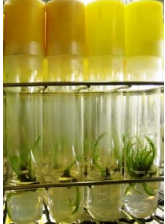
Musa in vitro

Somaclonal variation, while a problem with plants regenerated from single cells, callus or adventitious buds, is not common in plants micropropagated from axillary buds. The frequency of somaclonal variation occurring, gross chromosomal aberrations and in vitro selection are enhanced in prolonged tissue culture. Exposure to minimal growth conditions over long periods of time can also be expected to lead to genetic change. It is significant that asexually propagated species for germplasm conservation may