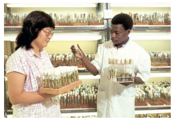
Dissemination of vegetatively propagated material

One of the major advantages of in vitro conservation of genetic resources is that tissue culture collections can be cleaned to provide a source of disease-free material. In vitro cultures are free of fungi and most bacteria while viruses can still be present. Therefore careful virus indexing procedures need to be applied to ensure material is disease free. Tissue culture storage also allows the conservation of germplasm in a protected environment, aseptic plant production, safe and easy international exchange of plant material and lower conservation costs. It is most appropriate for rapid multiplication purposes, dissemination and active collections.