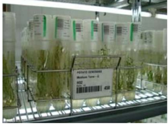
Potato In vitro collection at International Potato Centre (CIP), Lima, Peru".