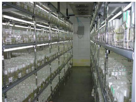
In vitro genebank for potato and sweet potato

Seed storage is the preferred conservation method. However, it is not feasible for germplasm from clonal crops which are either vegetatively propagated and/or do not produce seeds, or for species with short lived recalcitrant seeds. For some genotypes, elite genetic combinations are only preserved through clonal means. Their conservation is dictated by breeding strategy as heterozygosity does not permit the maintenance of desired characteristics. Clonally propagated plants incur special needs for their conservation. Common options for storage include maintenance in field genebanks, and for species producing dormant vegetative propagules, conservation in cold stores (Reed, 2001) called vegetative banks. These approaches have limitations regarding efficiency, costs, security and longterm maintenance. In vitro conservation, which involves maintenance of explants in a sterile, pathogen-free environment is therefore preferentially applied to clonal crop germplasm and multiplication of species that produce recalcitrant seeds, or do not produce seeds. It also supports safe germplasm transfers under regulated phytosanitary control. This modern technique has already been applied for multiplication, storage and collection of germplasm of more than 1000 species.