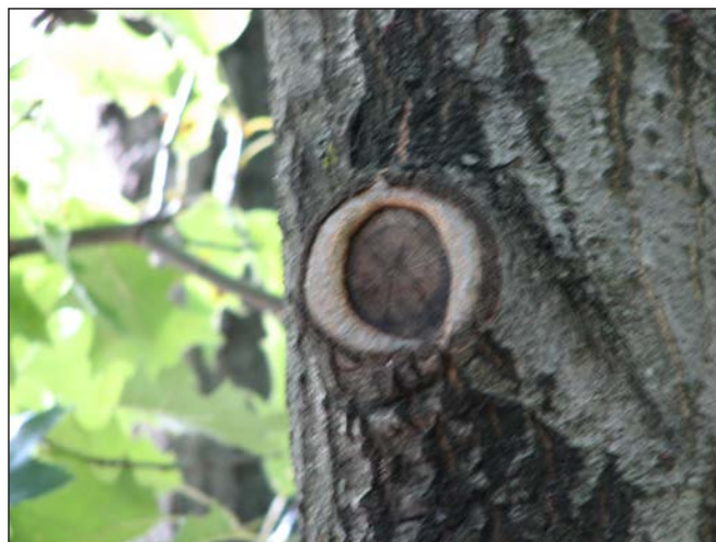
Figure 1. A pruning wound showing callus growth.

There are several ways that callus formation rates can be enhanced, or at least not inhibited. First, it is essential to avoid limiting oxygen availability to the wounded tissues. Oxygen is necessary for the proper healing process to take place. It thus follows